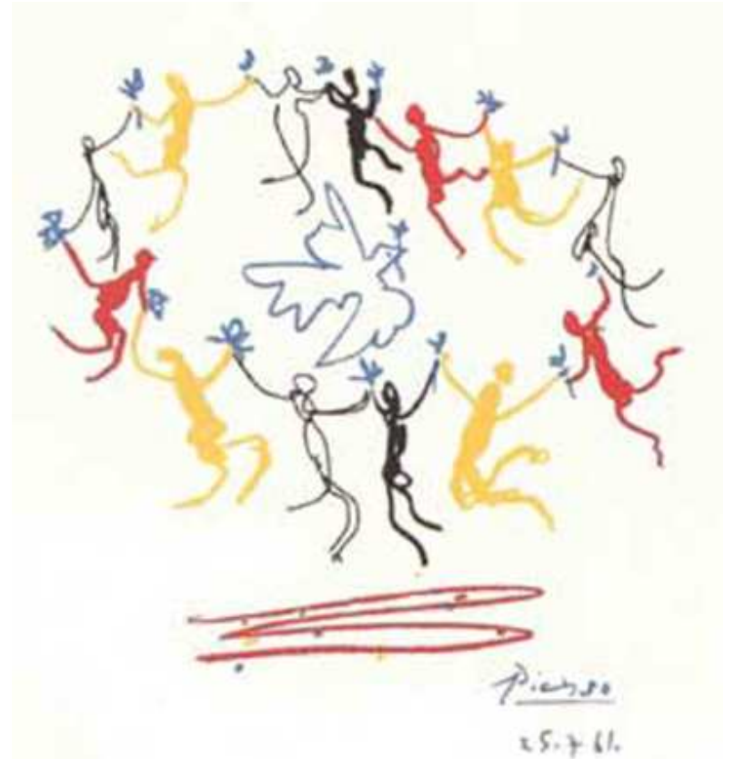
Pablo Picasso - Dance Around the Dove of Peace