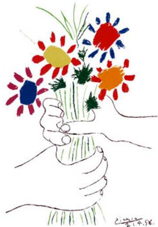
Pablo Picasso - Bouquet of Flowers