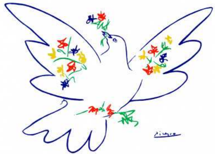
Pablo Picasso - Dove of Peace

It does not mean to be in a place where there is no noise, trouble or hard work. It means to be in the midst of those things and still be calm in your heart.